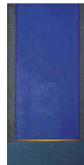
Eduard Angeli, Das blaue Tor