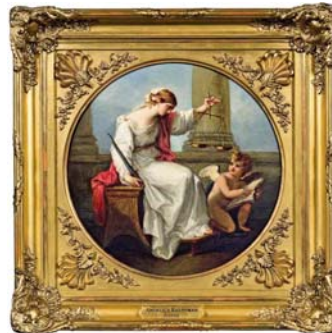
Angelika Kauffmann, Justitia