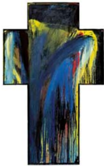
Arnulf Rainer, Kreuz

before 1982 from papier-mâché, carton and straw matting, which until the end of September 2008 was the highlight of the exhibition "Sit on