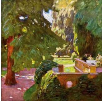
Carl Moll, Villa Primavesi

drawings by Gustav Klimt - all nudes except one depicting Adele Bloch-Bauer with hat – the estimated value for each of these is between € 60,000 and 120,000. Otto Rudolf Schatz , whose work has achieved such success at im Kinsky auctions recently, opens with " The bad news " (€ 180,000 – 250,000) and " View of St. Stephan's Cathedral from Vienna's first tower block " (€ 130,000 – 200,000). Two oil paintings, the first from 1944 telling of emptiness and hopelessness and the other from 1955 with a view of a better, brighter future.